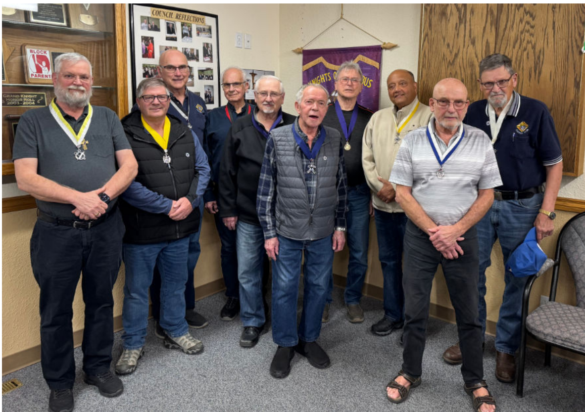
The executive team of Council 5726

Mary, Holy Mother of God...Pray for us! St Joseph, husband of Mary and earthly father of Jesus...Pray for us!